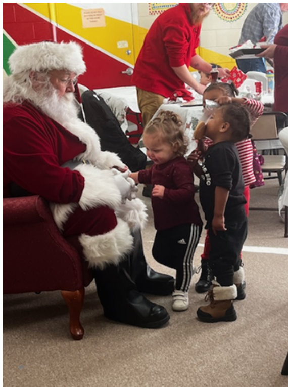
BREAKFAST WITH SANTA